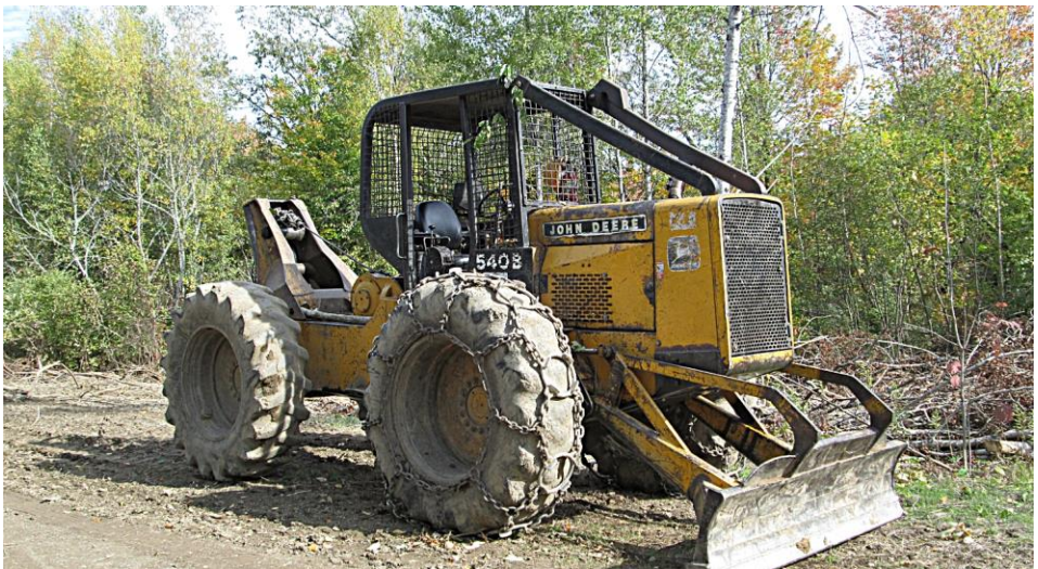
Cable skidder.

The type of harvesting equipment used on your property is a very important consideration. In many situations, a logger that uses a chainsaw and cable skidder is a good fit for your harvest. These types of loggers are generally referred to as conventional loggers. The cable skidders (or tractors) they employ are designed to drag the cut trees and logs out of the woods and to the access road. Conventional loggers are often a good choice for smaller properties with a limited amount of space to operate multiple pieces of heavy equipment.