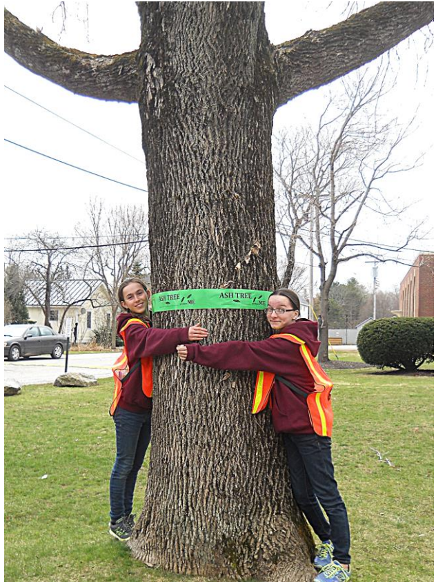
Mondo ash tree in Yarmouth, Maine.