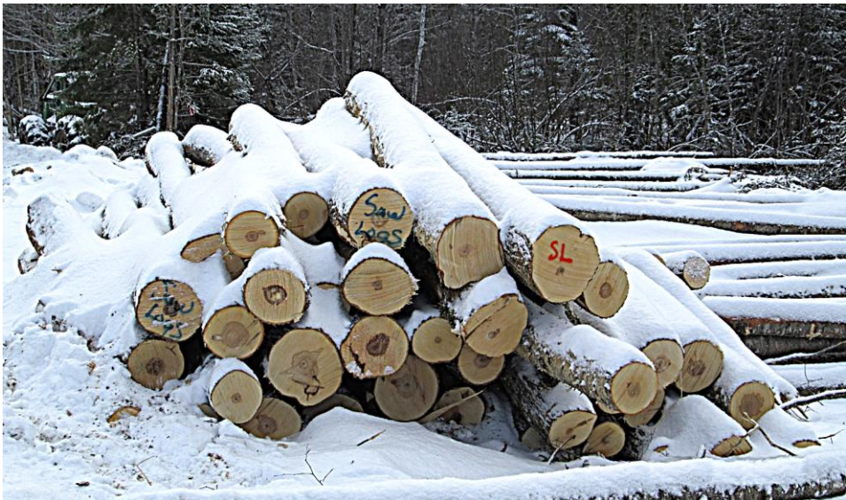
Log pile.

Dozens of commercially valuable tree species grow in Maine. They are used to manufacture wood and paper products that are sold both locally and around the world. Some of the products made from trees harvested in Maine include toothpicks, lumber, paper, and shingles. If you own more than a couple acres of forestland in Maine, you may be able to harvest forest products now or sometime in the future. That said, it is important to have realistic expectations for your property.