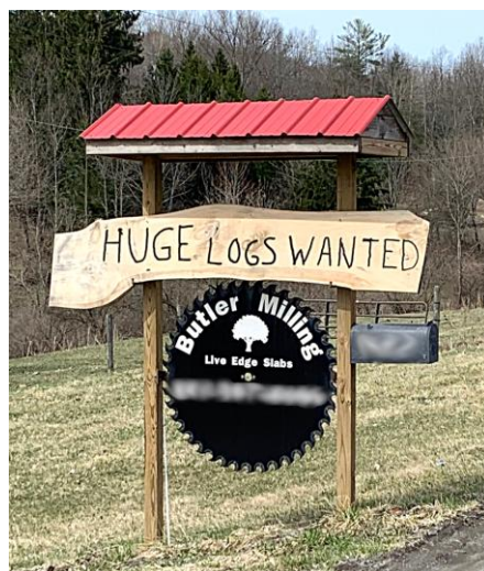
Sawmill sign.