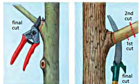
B. Cutting a small branch