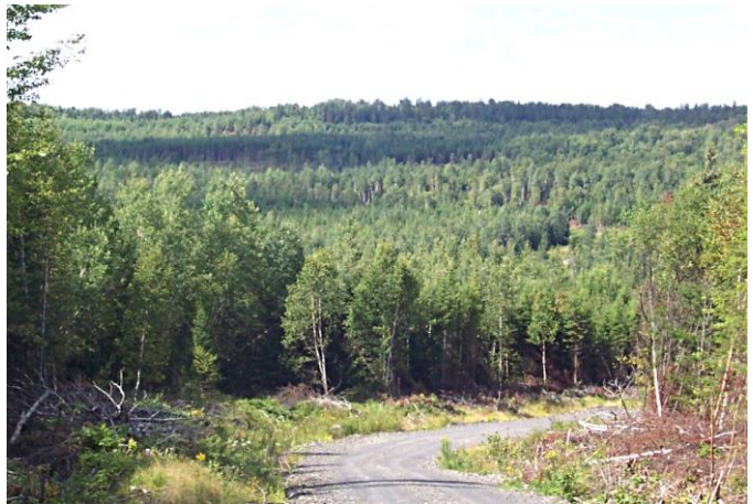
Access road.

Woodland access roads are typically necessary to implement timber harvests and many other forestry practices. In terms of harvesting, access roads are needed for timber to be loaded onto trucks for delivery to mills across the state. If an old road exists on your property, it might be improved to meet the current standards for logging and trucking. Don't get too concerned with road-building costs until you consider your payment options and the type of road you will need for your harvest. You should also consider that your timber harvest income should more than cover any road-building costs. It is a good idea to discuss this with your forester and logger ahead of time.