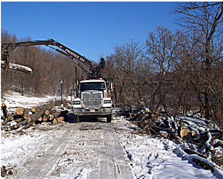
Winter road.

There are two basic types of roads and two basic levels of road work that may be used to provide access to your property. The two types are winter roads and all-season roads. Winter roads require the least amount of construction work and rely on frozen ground to support trucks and logging equipment. In contrast, all-season roads require the greatest amount of work and have the highest cost. All-season roads are built to a high standard and can serve as year-round access to your property. The two basic levels of road work are new construction and upgrading existing roads. This is like the difference between building a new house or renovating an old house. Be aware that sometimes old roads are in very poor condition and may be very costly to improve for logging.